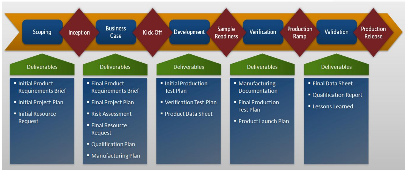
Figure 1: Sample NPI Process

An approach combining NPI process expertise and Windchill's powerful capabilities helps companies automate processes, streamline project execution, increase reuse and remove location barriers enabling companies to drive repeatable new product introductions as a result.